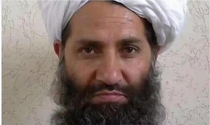
A picture of Haibatullah Akhundzada released in 2016