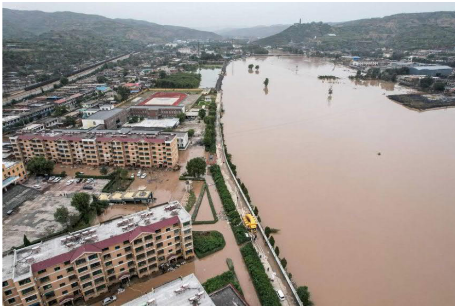
A flooded area after heavy rainfalls in Jiexu, China's northern Shanxi province